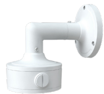
GGM AJB009+GGM AWMB016